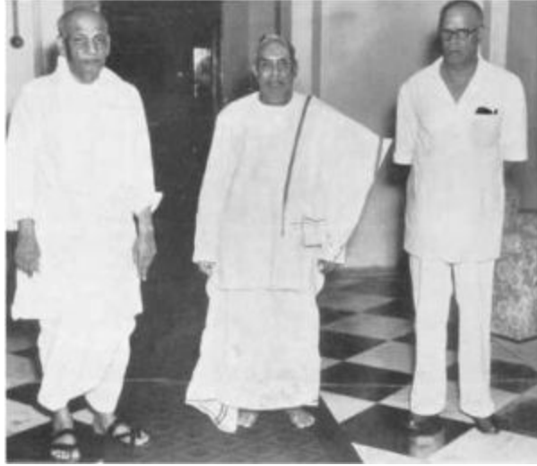
16. Sardar and the author with the Maharajah of Cochin during Sardar's last visit to Travancore-Cochin.