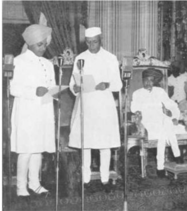
7. Prime Minister Nehru inaugurating the Madhya Bharat Union by swearing-in the Maharajah of Gwalior as Rajpramukh. Seated on right is the Maharajah of Indore.