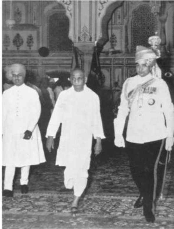
3. Sardar leaving the Durbar Hall after inaugurating the Rajasthan Union. On the right is the Maharajah of Jaipur, on the left the Maharajah of Kotah.