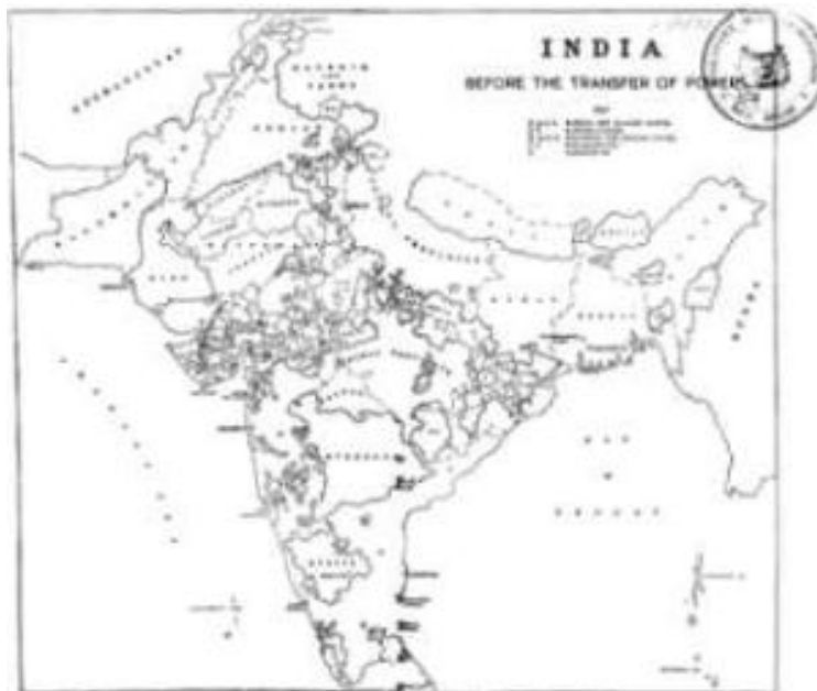
Based by permission on a Philip's Smaller School-room Map published by Messrs. George Philip and Son, Ltd., London.