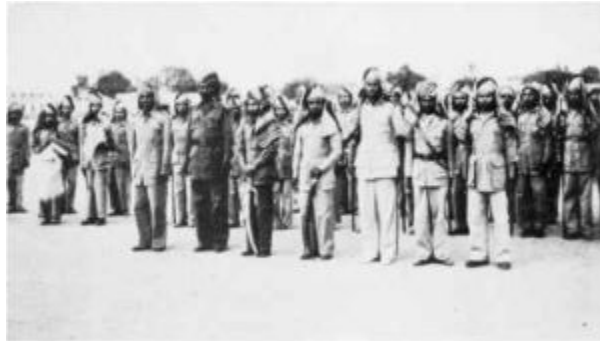
21. A Razakar rally. Kasim Razvi is third from left in the front row