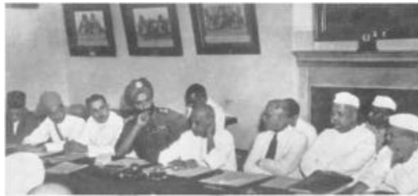
2. Sardar discussing the communal situation and the refugee problem with the premiers of the Punjab and the U.P. and rulers of border States.