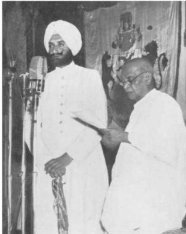
12. Sardar inaugurating the Patiala and East Punjab States Union by swearing-in the Maharajah of Patiala as Rajpramukh.