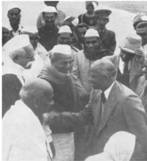
4. Sardar and the author being received by the Governor and Chief Minister of the Central Provinces at Nagpur.