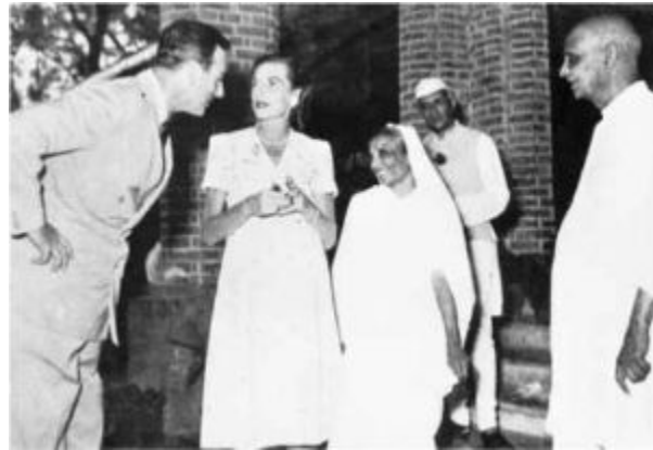
18. Lord and Lady Mountbatten taking leave of Sardar and his daughter at Mussoorie. In the rear is Prime Minister Nehru.