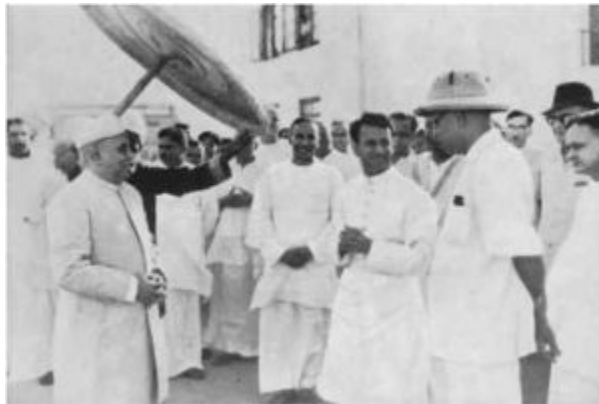
15. The Maharajah of Cochin on arrival at Trivandrum with the Maharajah of Travancore, the Premiers of the two States and the author