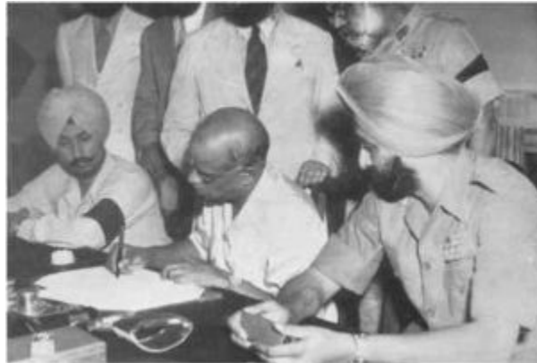
11. The author signing the Patiala and East Punjab States Union covenant.