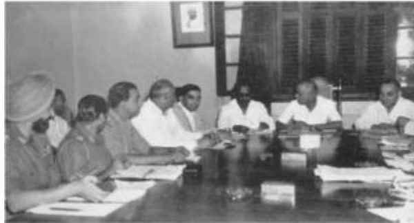
24. Conference of Rajpramukhs convened by the States Ministry to discuss the future of the Indian States Forces. On the left are the Rajpramukhs of Pepsu, Madhya Bharat, Rajasthan and Saurashtra.