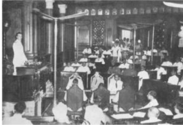
1. Lord Mountbatten addressing the Chamber of Princes for the first and last time as Crown Representative.