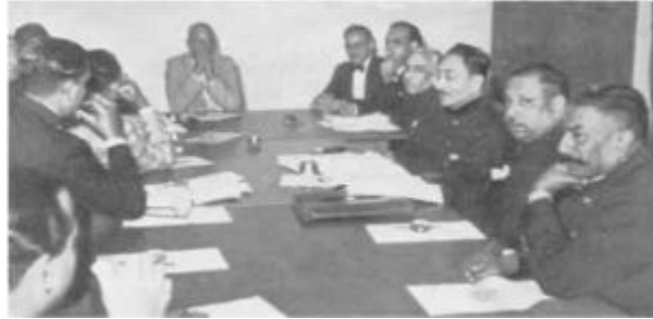
3. The author conferring with the rulers of A class States in Orissa.