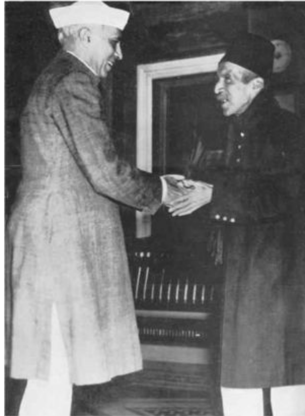
23. Prime Minister Nehru is greeted by the Nizam during his visit to Hyderabad State