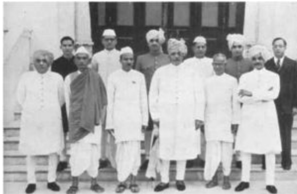
6. Council of rulers and ministers of Saurashtra Union. Third and fourth from right are the Rajpramukh and U. N. Dhebar, then Chief Minister, now President of the Congress.