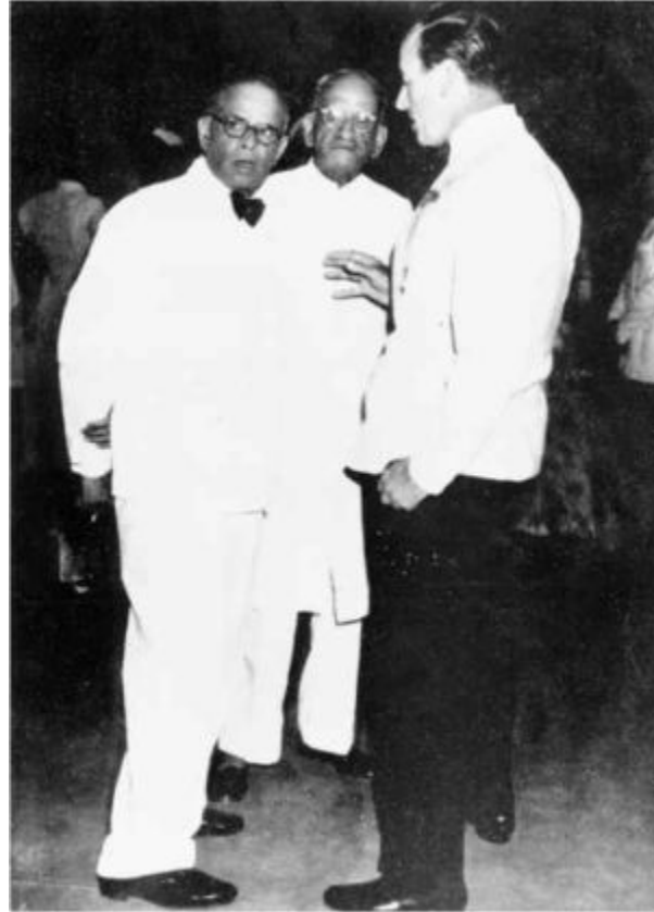
20. Lord Mountbatten, N. Gopaldaswami Aiyangar and the author discussing the Hyderabad question at a party on 30 May 1948