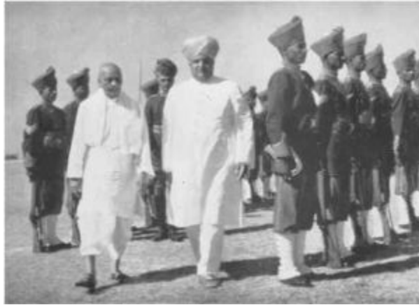
14. Sardar with the Maharajah of Mysore during his visit to the State.