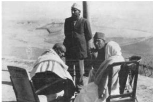
9. Sardar having discussions with Sheikh Abdullah and Bakshi Ghulam Mahommed during his visit to Kashmir early in November 1947.