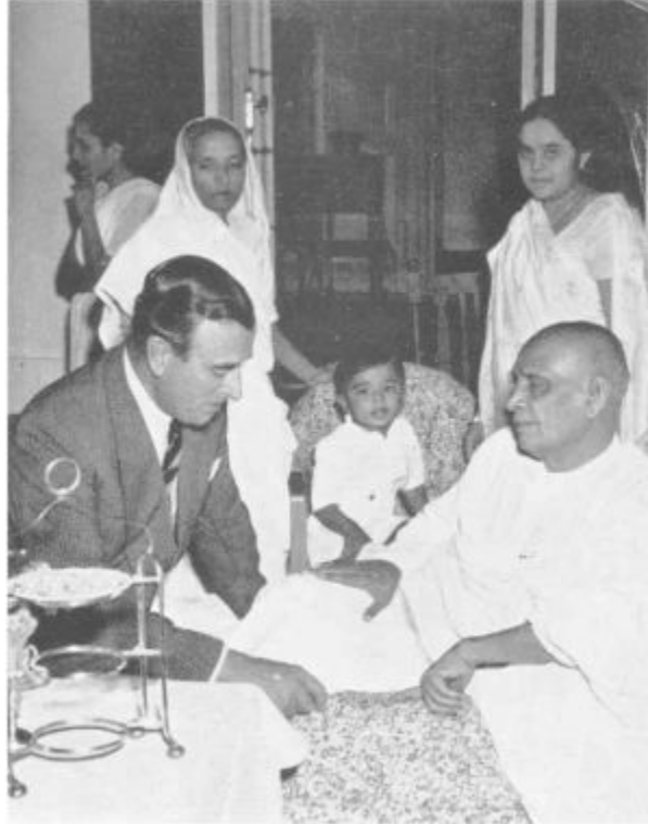
8. Lord Mountbatten in conversation with Sardar during his illness.