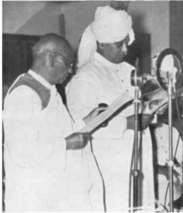
5. Sardar inaugurating the Saurashtra Union by swearing-in the Jam Saheb of Nawanagar as Rajpramukh.