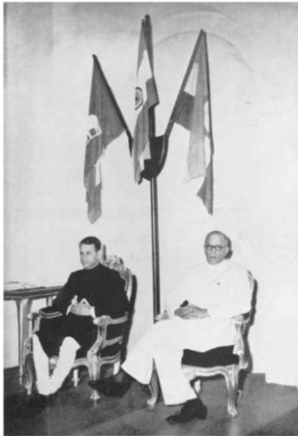
17. The author with the Maharajah of Travancore inaugurating the Travancore-Cochin Union