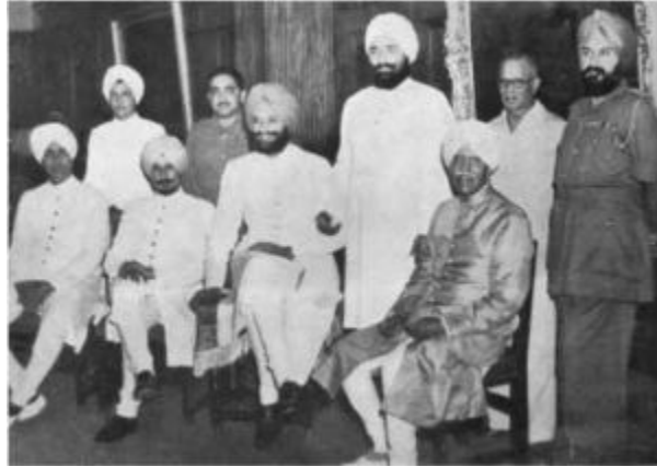
10. The rulers of Patiala and the East Punjab States with author