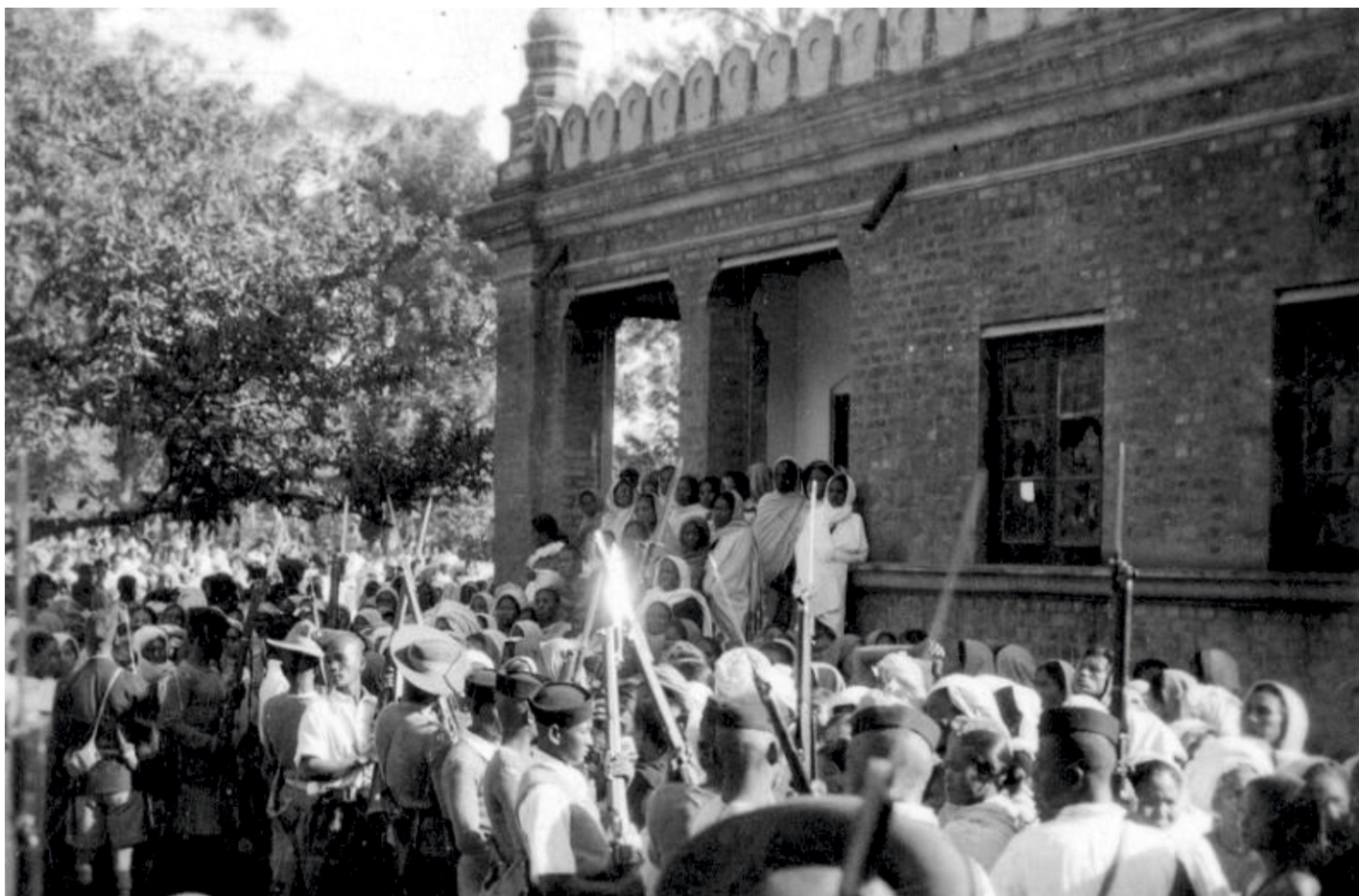
Nupi Lan: The Women's War in Manipur, 1939