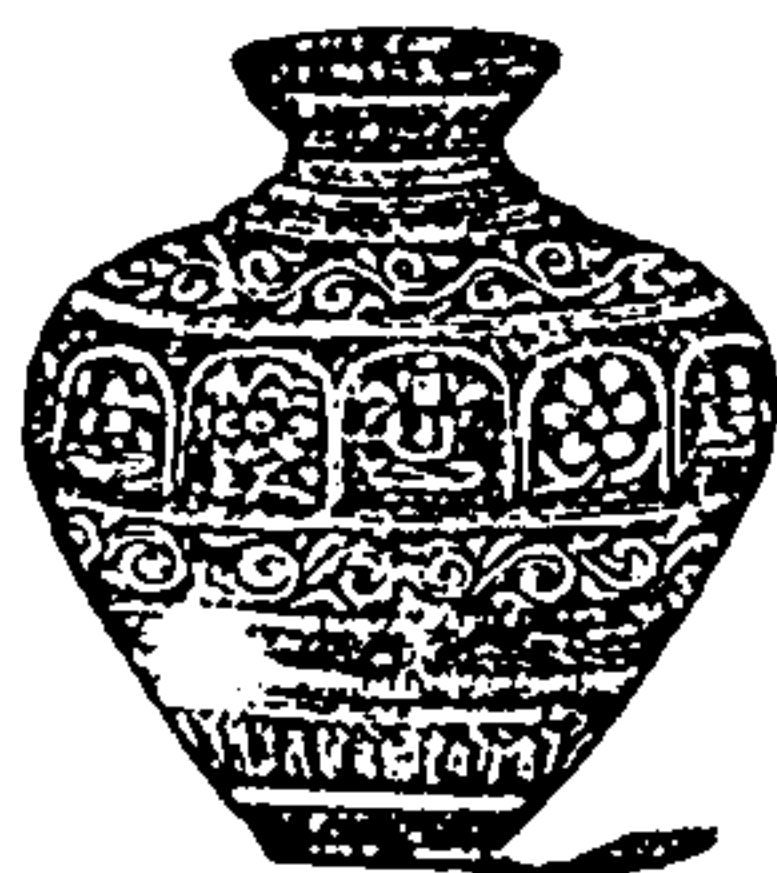
कलश Ghata (brass and copper) at Rs. 20.