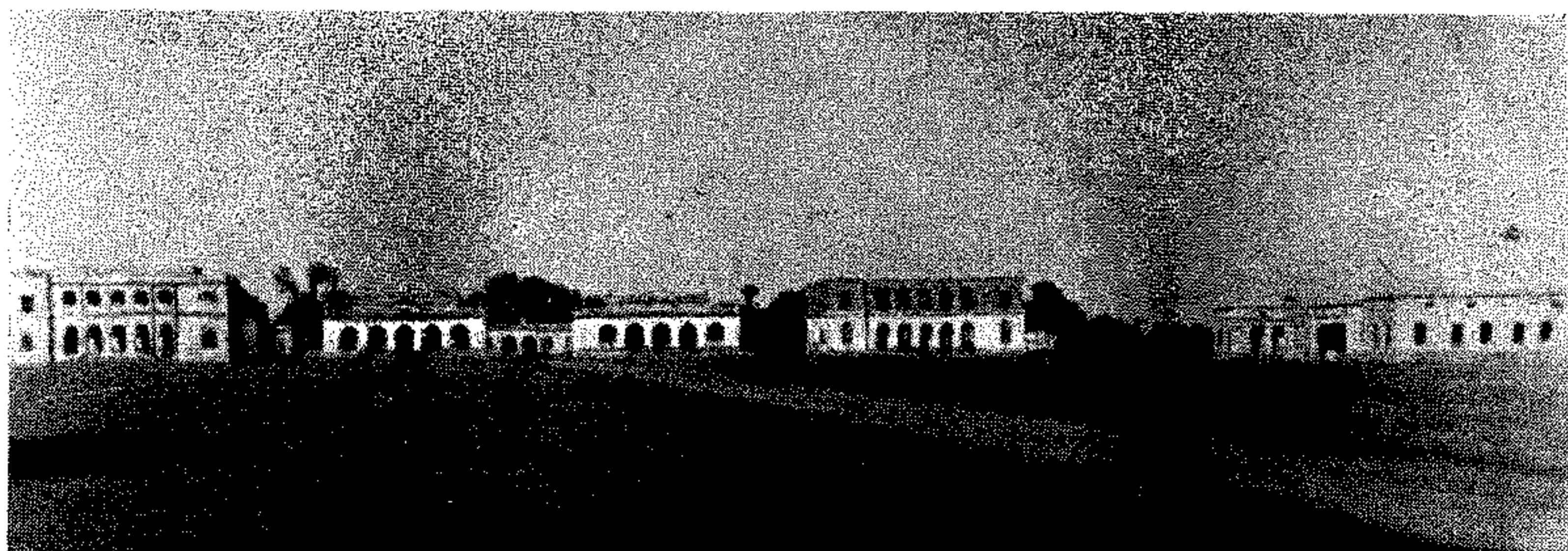
VIDYAPITH IN 1934

fruitful. Do you call it education which makes boys and girls after going out of the portals of a university spend their leisure moments spared to them after earning their bread, in reading sensational novels? Just go round the premier book-shops of Calcutta and see the stuff that is stocked there and mark the ever-increasing number of periodicals of bad taste. Education indeed! The first thing, therefore, required in education is the training of the will. But it is not enough if the will is trained to be noble, it must also be efficient and that is what necessitates the training in diverse branches of knowledge. But mere efficiency with-