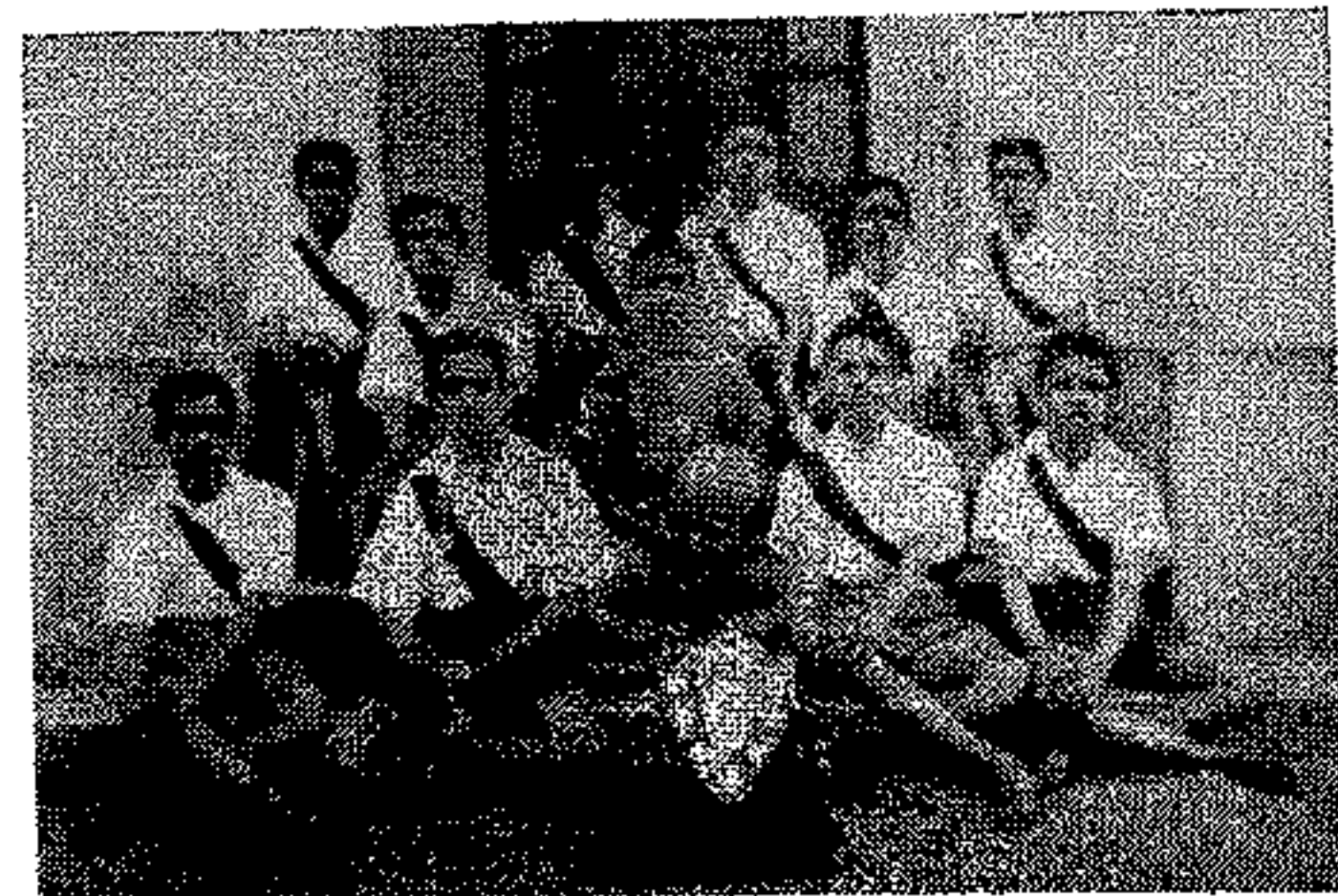
WINNERS OF THE INTER-SCHOOL FOOTBALL COMPETITION

In common with other schools, academic education forms a very large and important part of the training imparted, but the monotony of the school lesson is much mitigated and tempered by extra-academic courses such as music and gardening. As in other schools, there are regular classes of six periods covering a total period of four hours and a half daily, but the periods are so arranged that unlike the ordinary schools, least strain is caused to boys' brain and health. The boys are coached for the Matriculation examination of the Calcutta University, but the