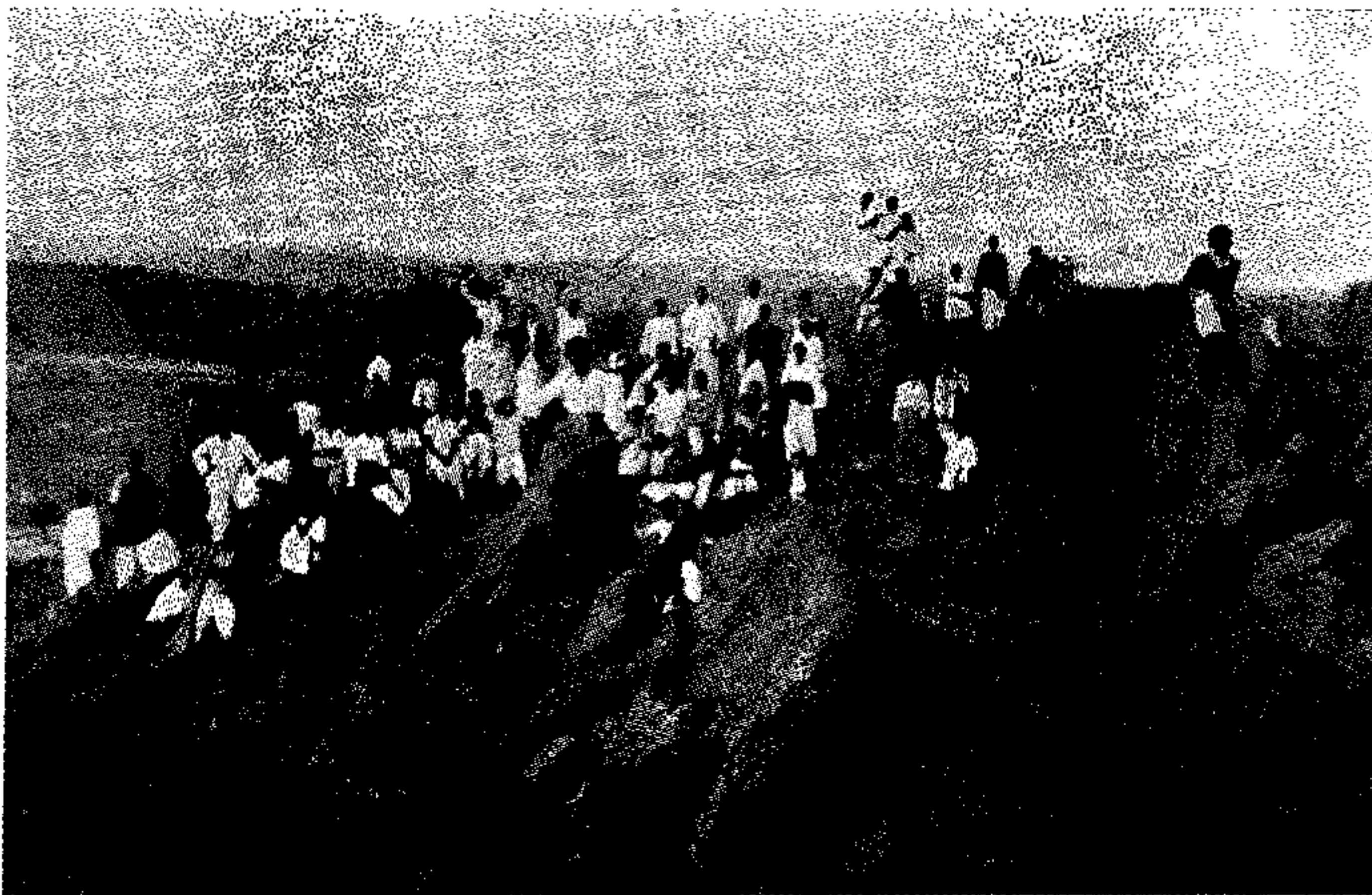
EXCURSION PARTY ON THE "NANDAN" HILL

and the idea that self-respect is not inconsistent with manual labour is inculcated in them. They learn by practice that the good of all is the concern of all, and the qualities of mutual help and corporate life are developed in them. The Vidyapith, as it seems to me, is to some extent a self-governing institution where the boys have got community of interest and purpose. On the literary side, there are vernacular dailies and periodicals for the boys to read. There is a debating club also, where boys take part in debates. The boys conduct two