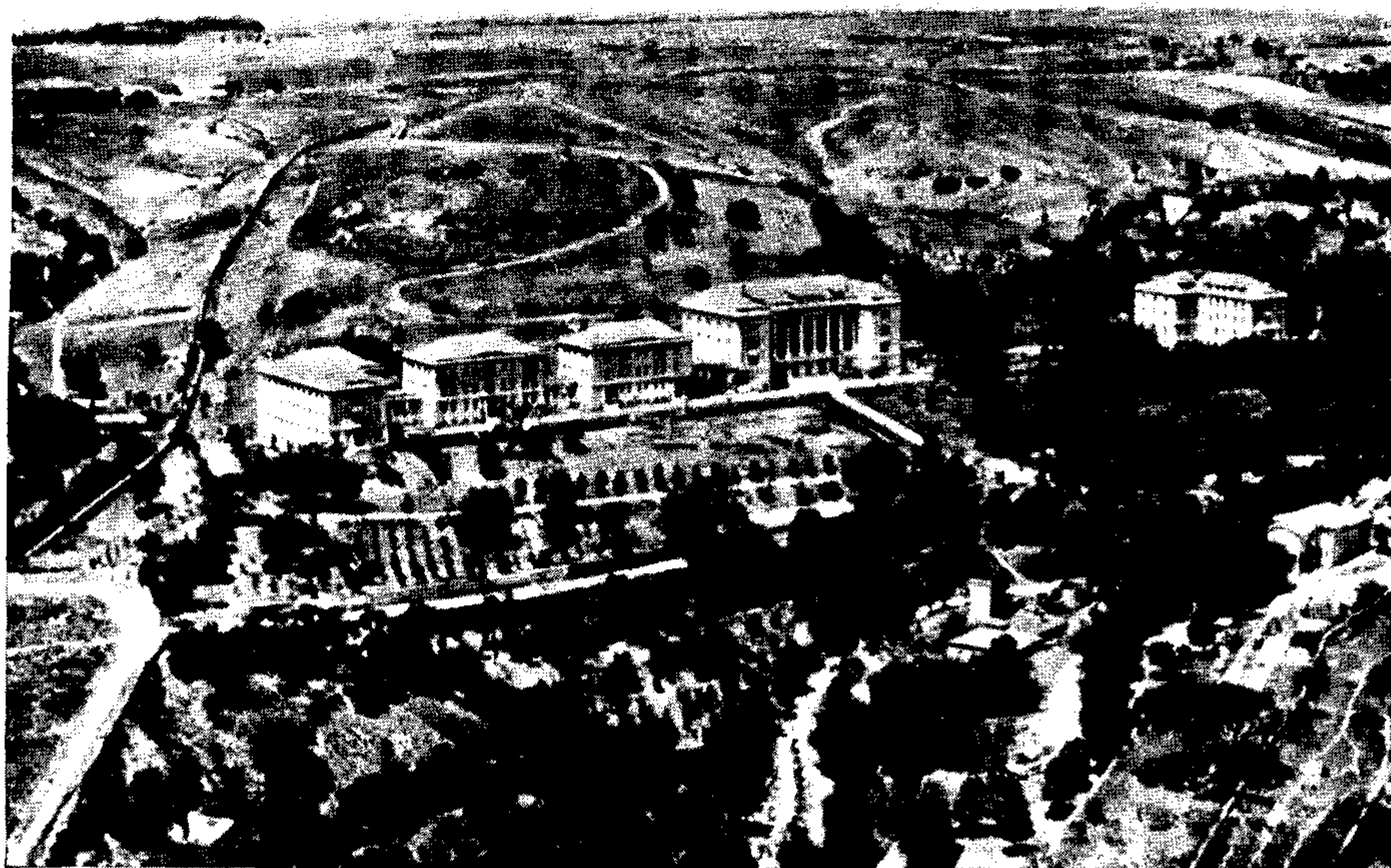
American College for Girls, Scutari (Constantinople), from an aerial photo taken in the 1920's. In the chapel of this college Swami Vivekananda gave a lecture on Hinduism on November 2, 1900.