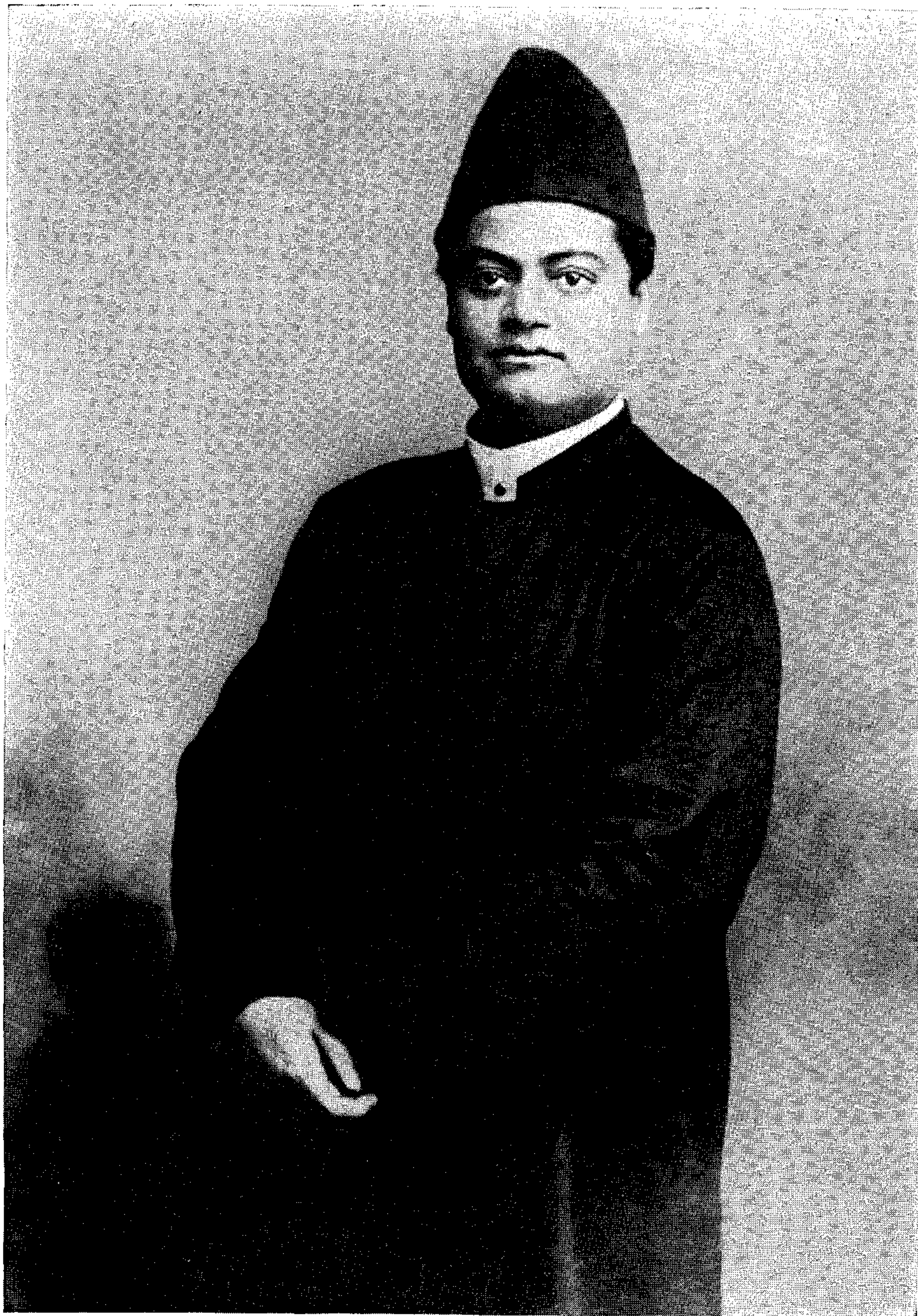
Swami Vivekananda at Constantinople in 1900