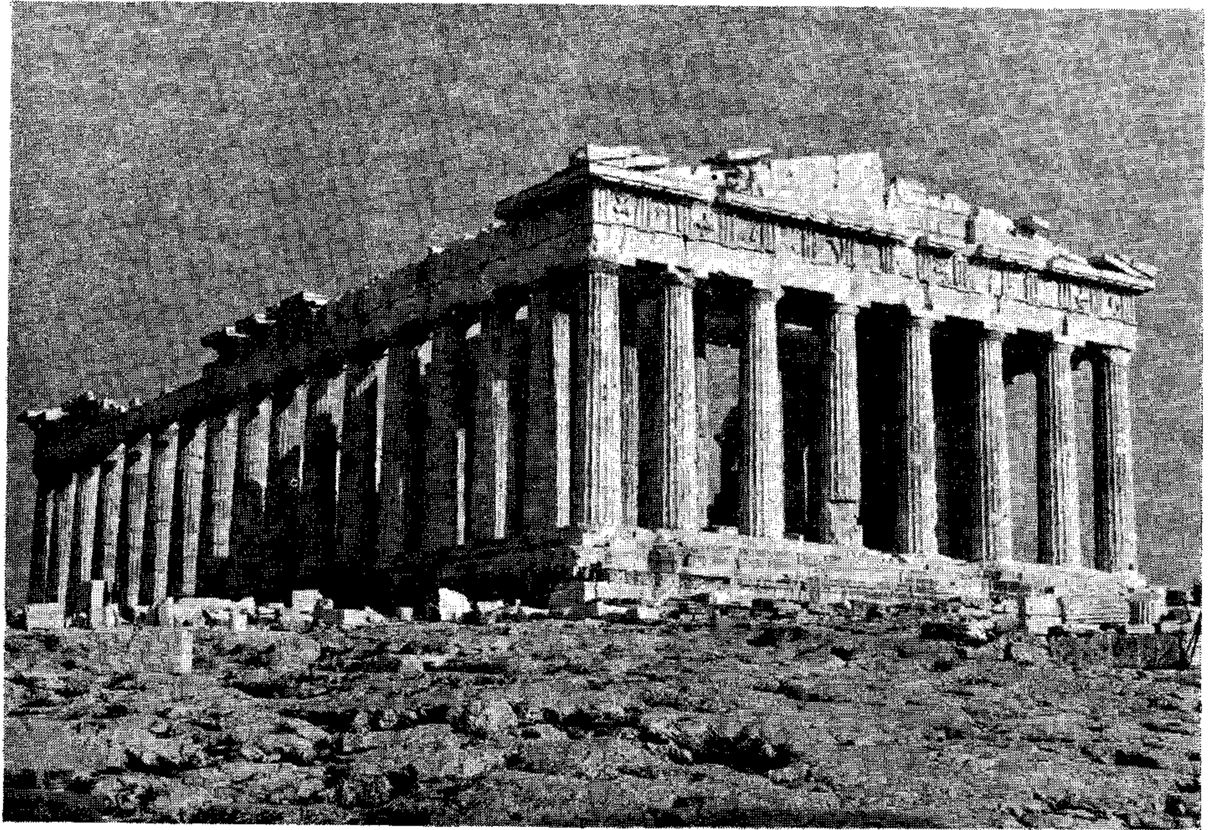
The Parthenon from the Northwest