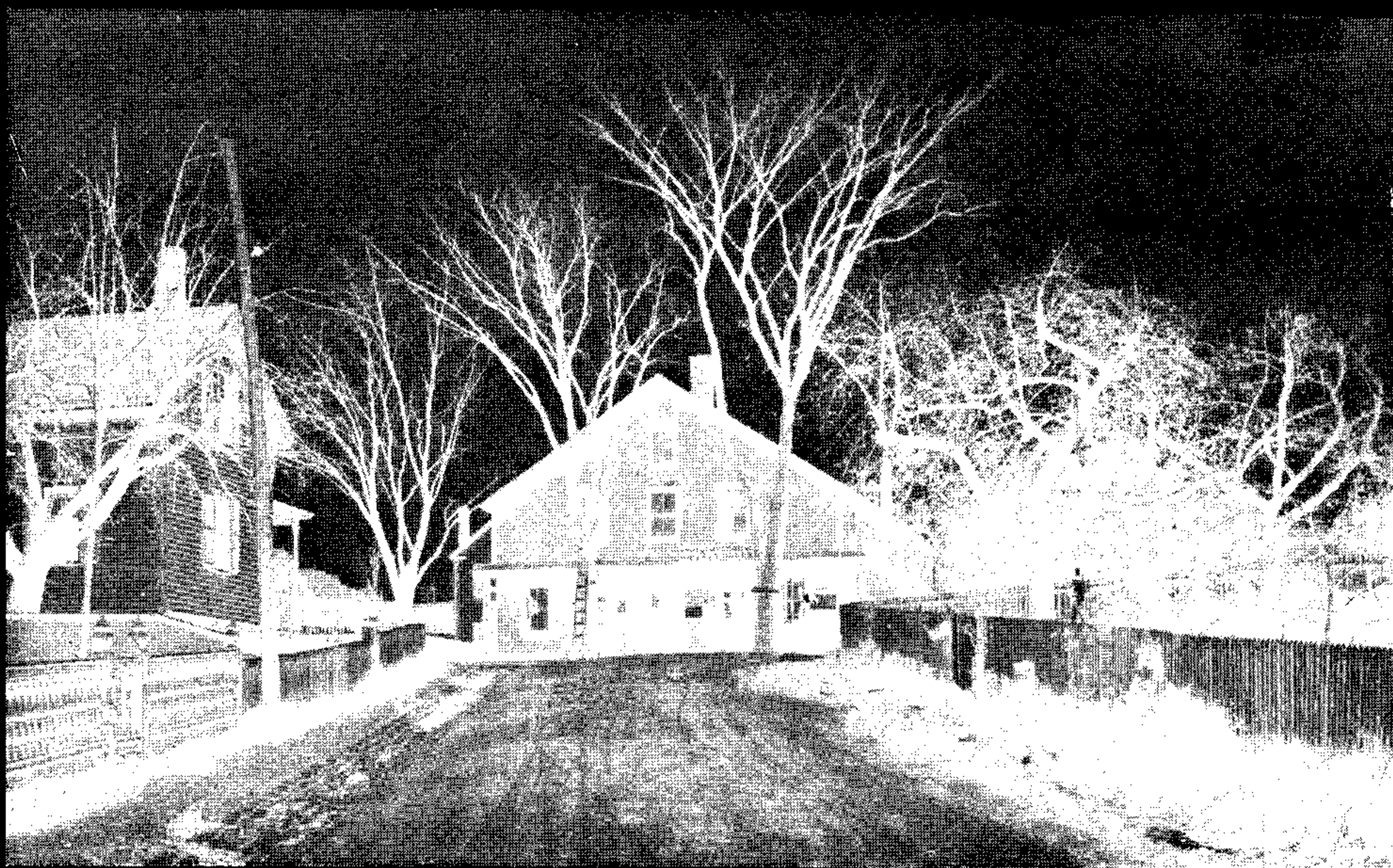
A closer look at Mechanics Hall. Swamiji spoke upstairs in what was called The Loft. The ground floor had a small store. Picture taken in the 1880's.