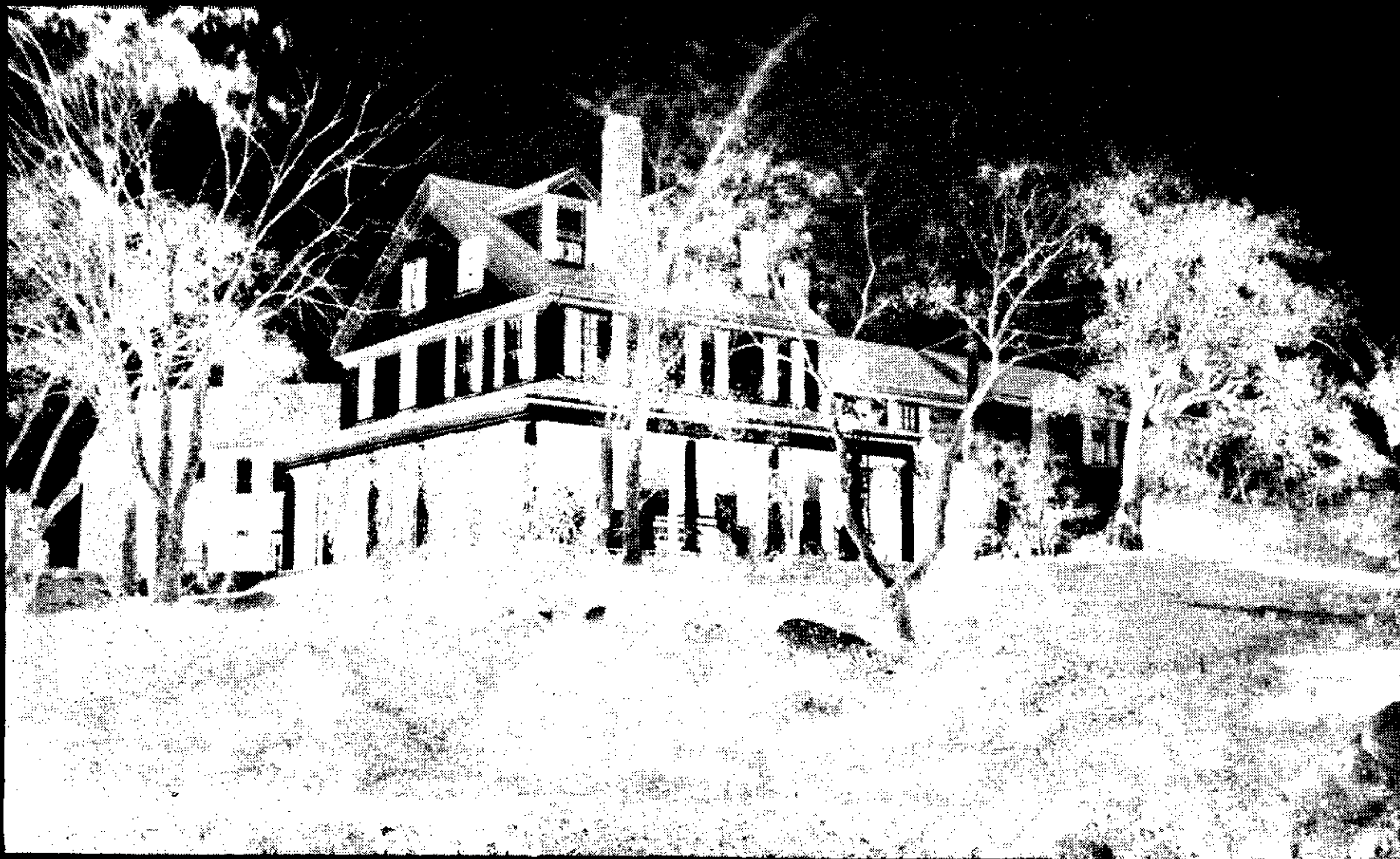
Charlotte Lane's where Swami Vivekananda stayed in 1893. The Lodge is out of sight to the left of the picture.