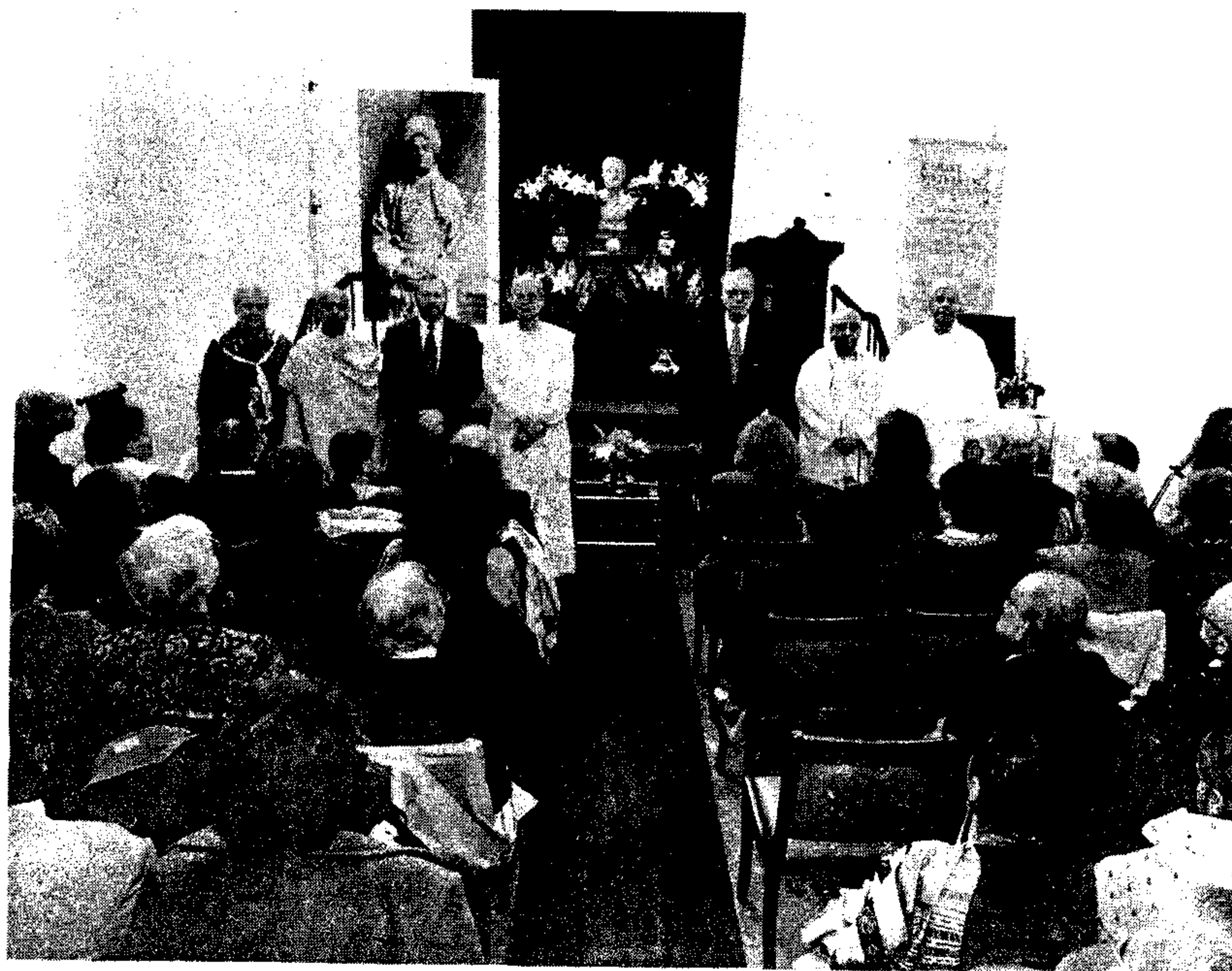
RAMAKRISHNA-VIVEKANANDA CENTER OF NEW YORK CENTENARY PROGRAM IN THE CHAPEL OF THE CENTER ON NOVEMBER 7, 1993 AT 11:00 A.M. SHOWING THE ALTAR, PART OF THE CONGREGATION, AND THE PARTICIPANTS