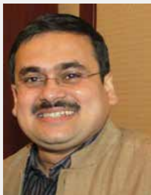
Dr. Anirban Ganguly

While some propagate their concern for the poor because of political reasons or simply because it is fashionable to do so, Prime Minister Modi's government has consistently and constantly striven for the empowerment and inclusion of the marginalised. In fact its governance and policy focus has been to realise that objective.