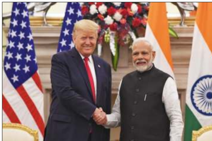
P.M Narendra Modi and President Trump at the Hyderabad House

U.S President Donald Trump and Prime Minister Narendra Modi held a closed-door meeting apart from the delegation-level talks at the Hyderabad House on Tuesday in which the two leaders touched upon a host of issues. The two leaders touched upon tackling Pakistan-sponsored terrorism and the big budget defense deal signed between India and the US. India and the US signed a $3 billion defense deal including advanced American military equipment, including Apache & MH-60 Romeo Helicopters - finest in the world. These will enhance our joint defense capabilities. They signed 3 MoUs - including a pact in the energy sector, one on mental health challenges.