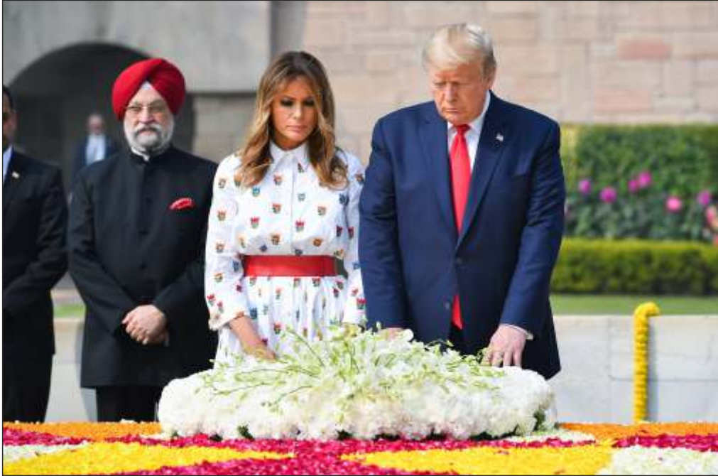
President Trump and First Lady Melania laid a wreath and paid floral tribute at the memorial. He also observed one minute of silence.