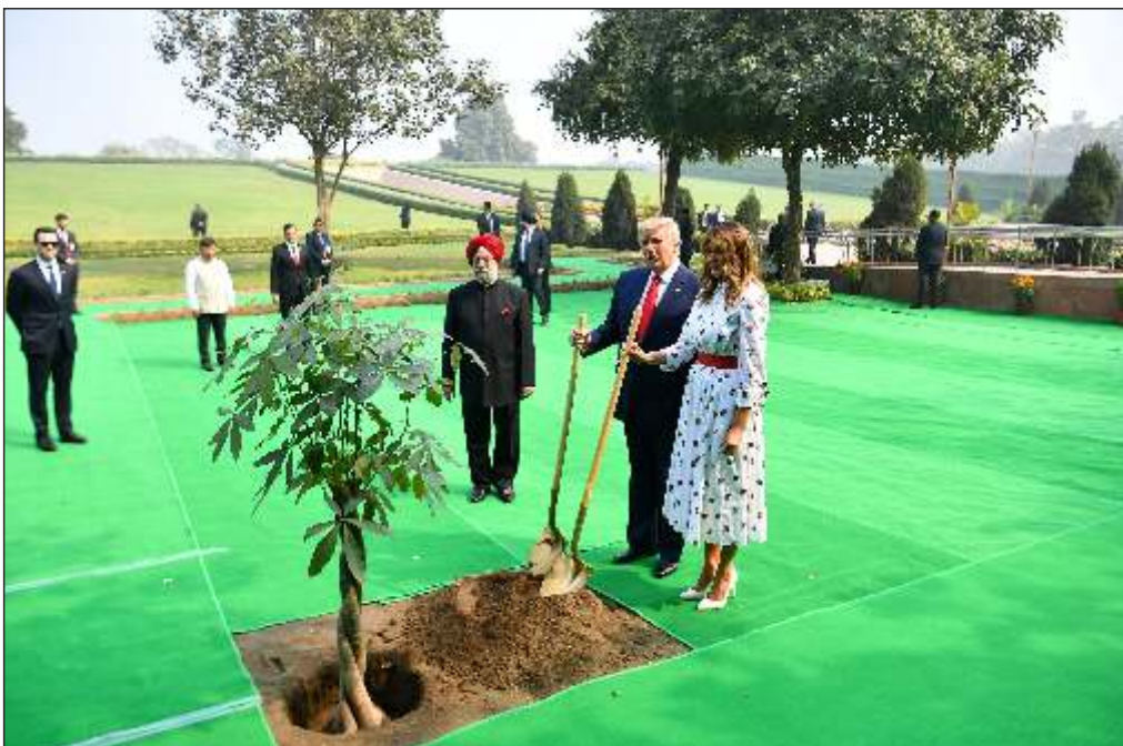
President planted a sapling at Rajghat