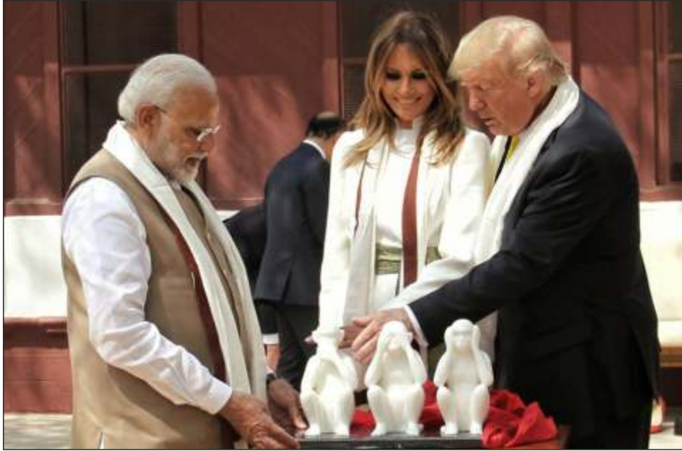
Prime Minister Modi presented "Three Wise Monkeys" as a memento to the US president.