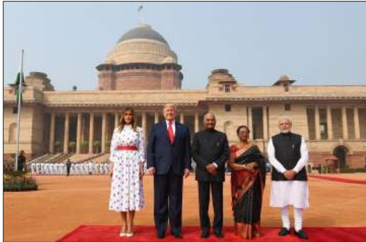
President Donald Trump and First Lady Melania pose for a photo during the ceremonial function at the Rashtrapati Bhavan