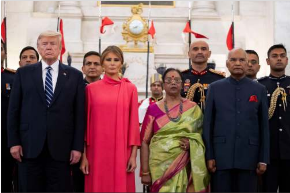
President Donald Trump and First Lady Melania for the Banquet in Rashtrapati Bhavan

President Trump and First lady Melania along with his daughter Ivanka and son-in law Jared Kushner completed their successful visit to India with the following remarks