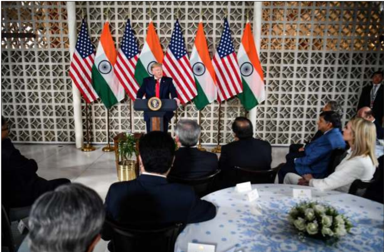
President Trump addresses Indian Business Community at New Delhi