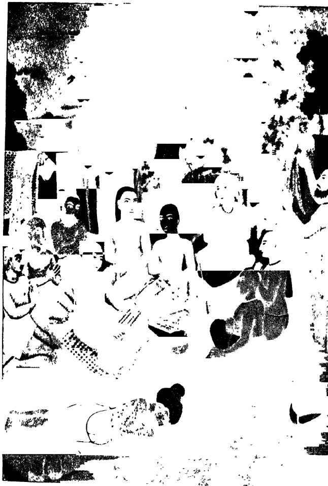
Chaitanya hearing the Bhagabat read. (From an old picture in the possession of the zamindar of Kunjaghata