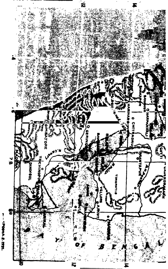
... - Poonna, 2: 1931.