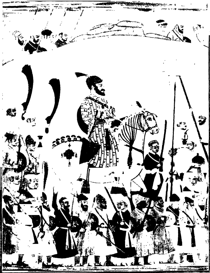
Shivaji on an Expedition into the Karnatak.