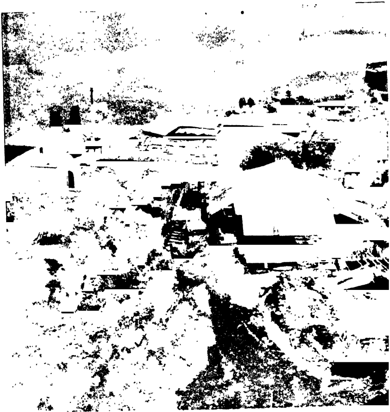
Bhawani Temple, Pratapgad.